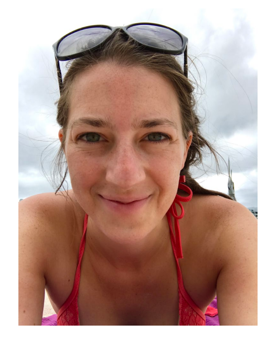
Hier encore - Cairns -

Tomorrow the holiday ends. I am not leaving Australia just yet though: I will work from Melbourne and Sydney this week. Internet being rather awful in Australia and the cafes closing at 4pm in Melbourne, I probably will not make table turns. The week begins rather well however: this Monday is a public holiday in the US!