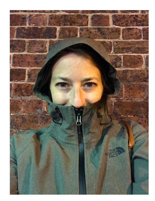
Aujourd'hui - Melbourne -